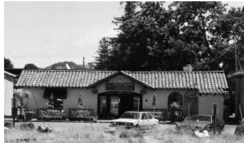
Figure 3.4 View of station from west.

The Plan area also contains the site of a station of the Northwestern Pacific Railroad, originally built in 1891. As a major commuter facility on an electrified line that connected with ferries to San Francisco, a local history described this station as "the hub and heart of Larkspur in its heyday." As such, it was a major contributor to, and determinant of, the early settlement pattern of Larkspur. Remaining evidence of former railroad use in the Plan area consists of an elevated track grade and a station house and warming shelter which face each other at the former station site (see Figures 3-4, 3-5). These two structures were built to replace the original station in 1929. In addition, the original station master's house and a baggage