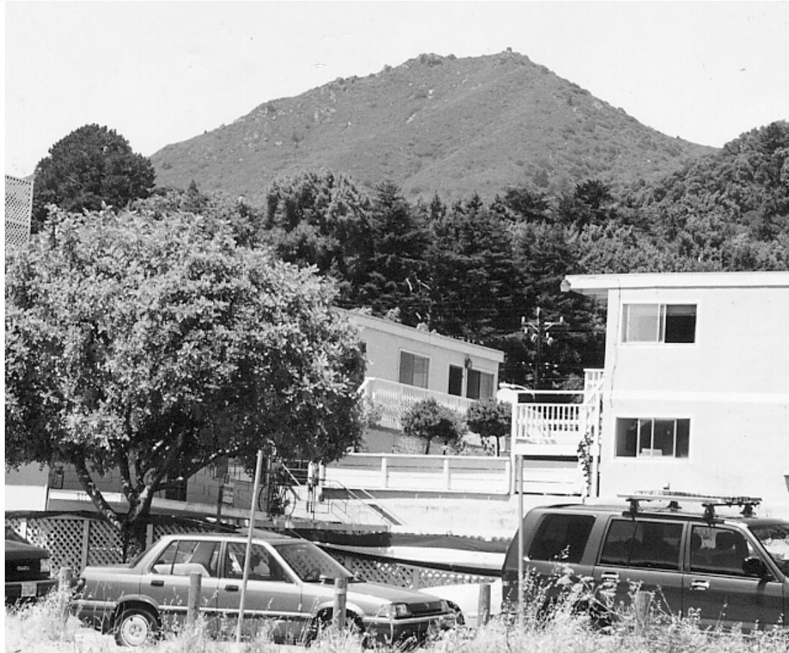
Figure 3.7 View of Mt. Tamalpais looking west from Plan area.