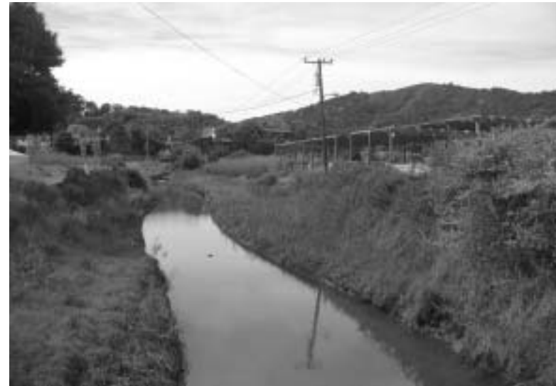
Figure 3-6 Larkspur Creek