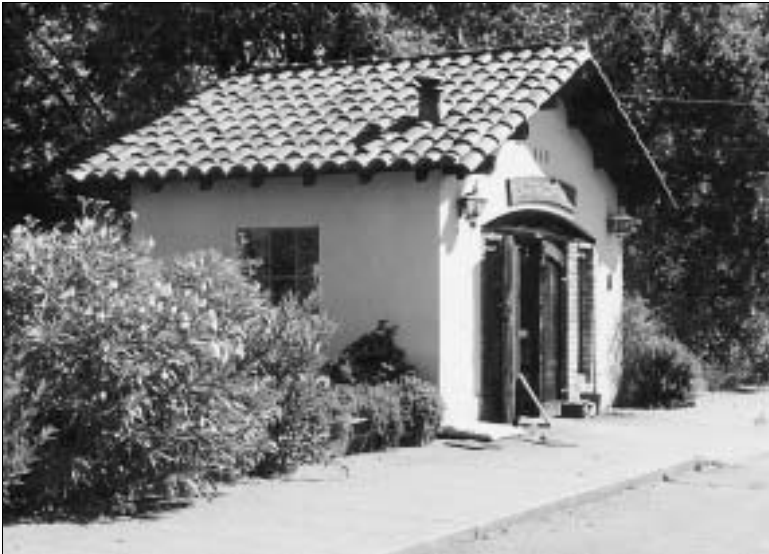
Figure 3-5 View of warming house from north.

storage shed still exist and have been incorporated into the American Legion facility. Additionally, the abandoned greenhouses on the Niven property provide a key indicator of former major uses within the Plan area.